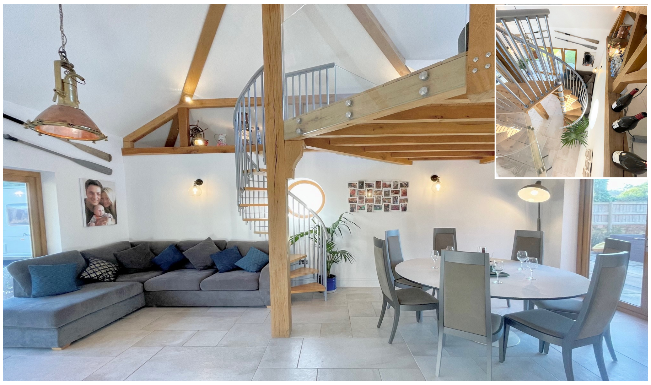
OPEN PLAN DINING ROOM/ LIVING AREA Impressive room with vaulted ceiling. Rear elevation bi-folding oak framed double glazed door leading to the main rear garden and oak framed double glazed French doors leading to the front garden, ideal for Alfresco dining. Ceramic tiled floor with underfloor heating throughout. Feature mezzanine level enclosed by glass panelling and accessed via a spiral staircase. Side elevation feature oak framed port hole window. Wall mounted lights and two side elevation UPVC windows. Feature high level display area in oak.