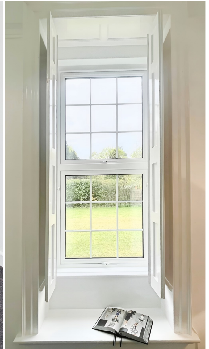
Bedroom two offers a sash window with a window nook, offering views over the communal grounds. This bedroom also benefits from a built-in storage cupboard.