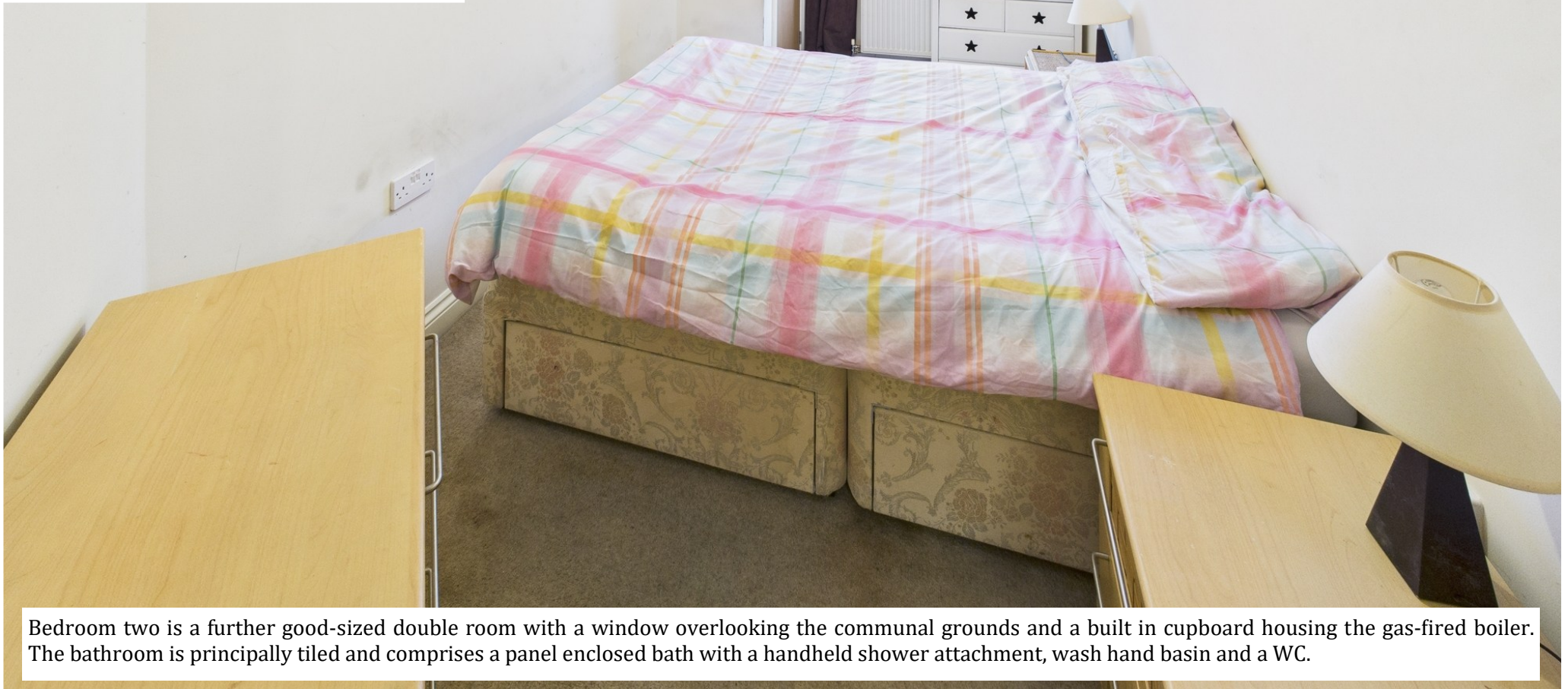
Bedroom two is a further good-sized double room with a window overlooking the communal grounds and a built in cupboard housing the gas-fired boiler. The bathroom is principally tiled and comprises a panel enclosed bath with a handheld shower attachment, wash hand basin and a WC.