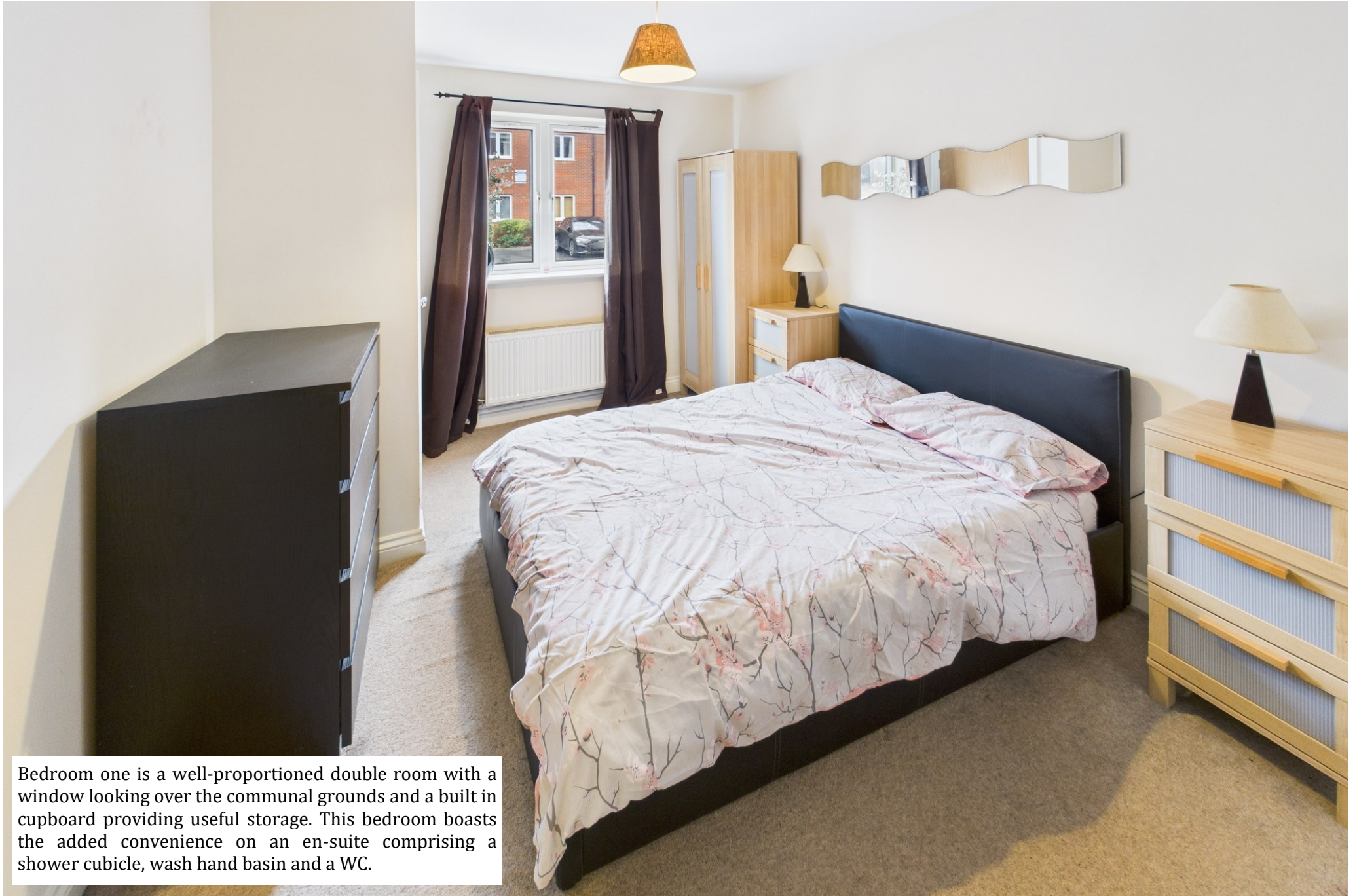
Bedroom one is a well-proportioned double room with a window looking over the communal grounds and a built in cupboard providing useful storage. This bedroom boasts the added convenience on an en-suite comprising a shower cubicle, wash hand basin and a WC.