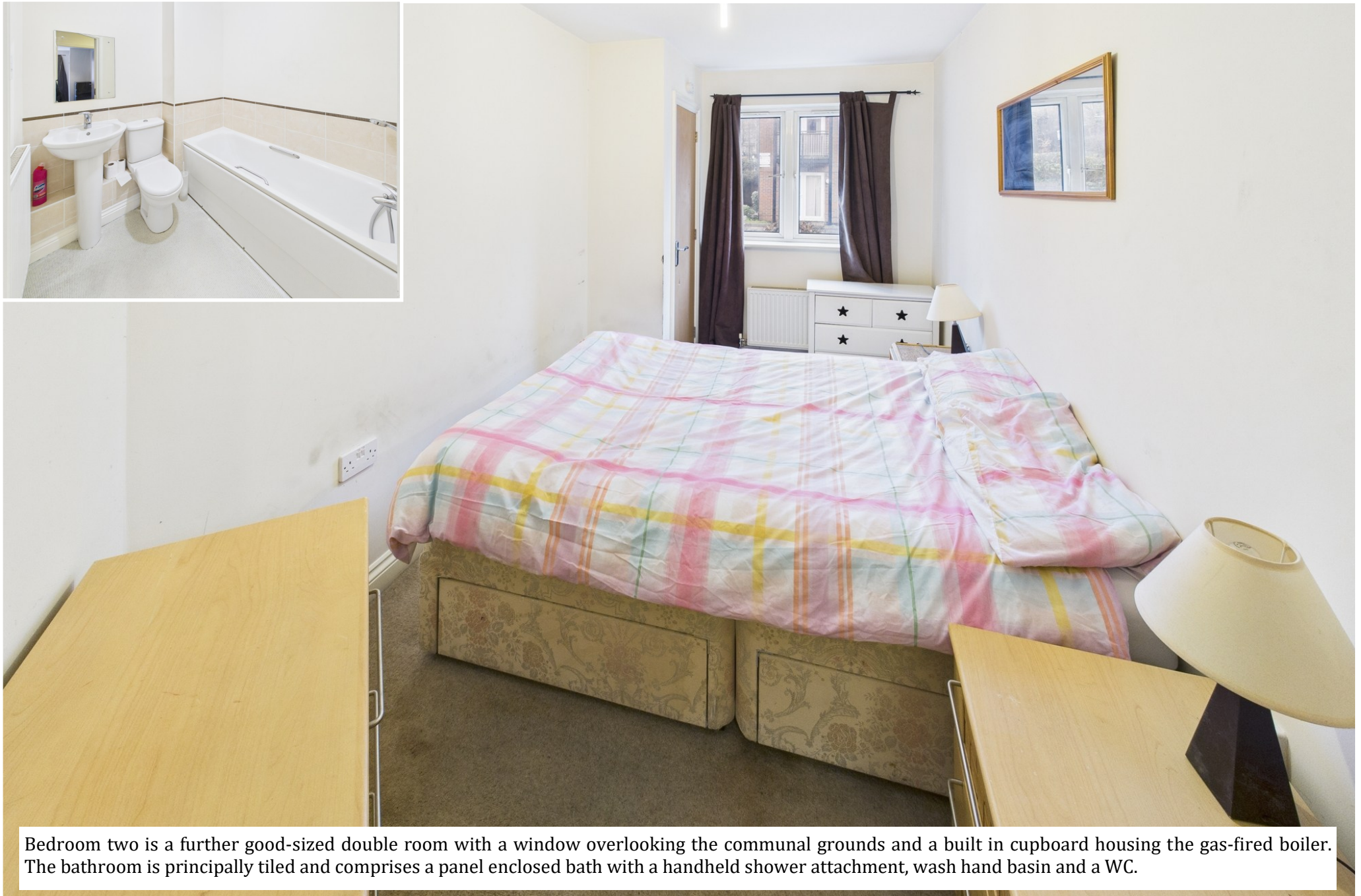
Bedroom two is a further good-sized double room with a window overlooking the communal grounds and a built in cupboard housing the gas-fired boiler. The bathroom is principally tiled and comprises a panel enclosed bath with a handheld shower attachment, wash hand basin and a WC.