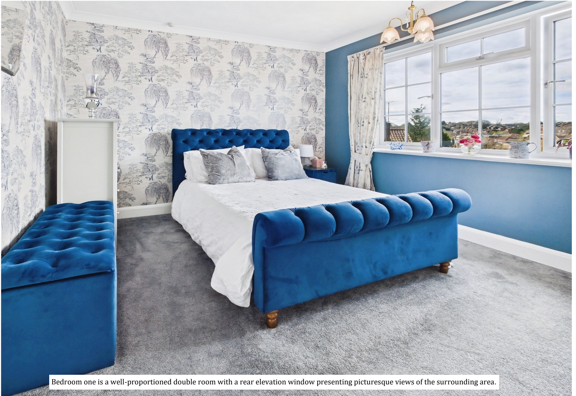
Bedroom one is a well-proportioned double room with a rear elevation window presenting picturesque views of the surrounding area.